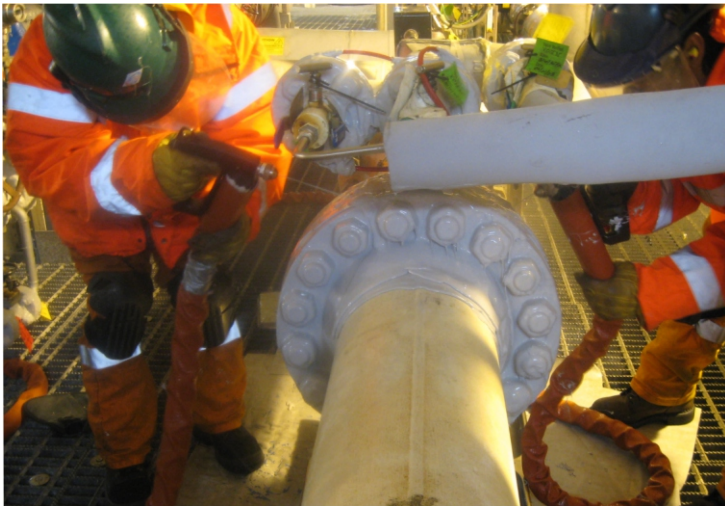
Left: two Enviropeel applicators work from either side of a large flange joint.