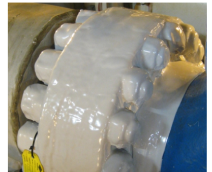
Above and below: A review of the finished applications shows the high standards maintained throughout the project.