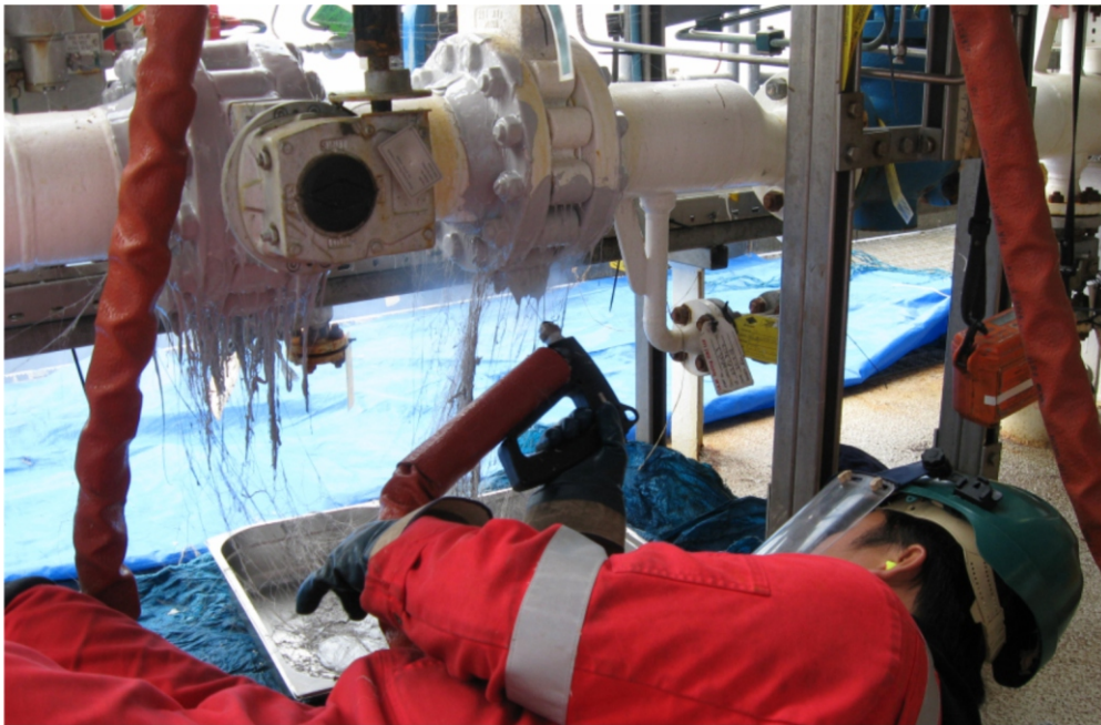
Below: during application a joint can look messy, but once both coats are completed and trimmed the joints look, and are, ready for the worst conditions the North Sea can throw at them!