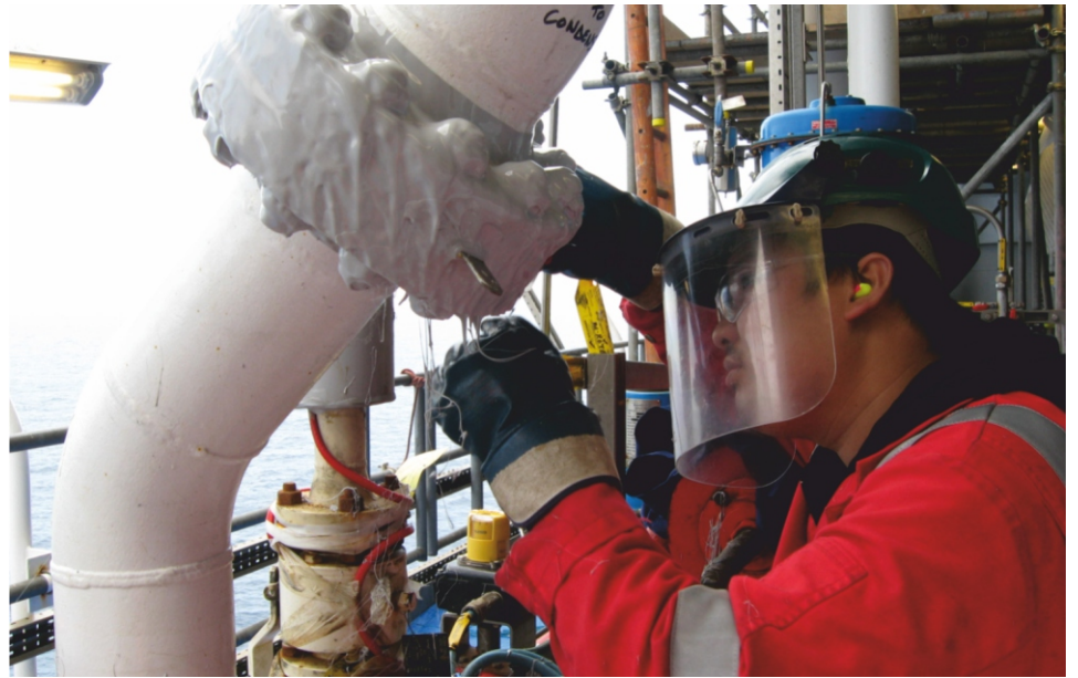
Application builds coats in succession, working from underneath, around the sides and finally above with two coats to provide maximum protection. The underside is the most difficult area to finish aesthetically but trimming between and after each coat ensures full protection. All trimmings and drips/spills are collected and recycled.