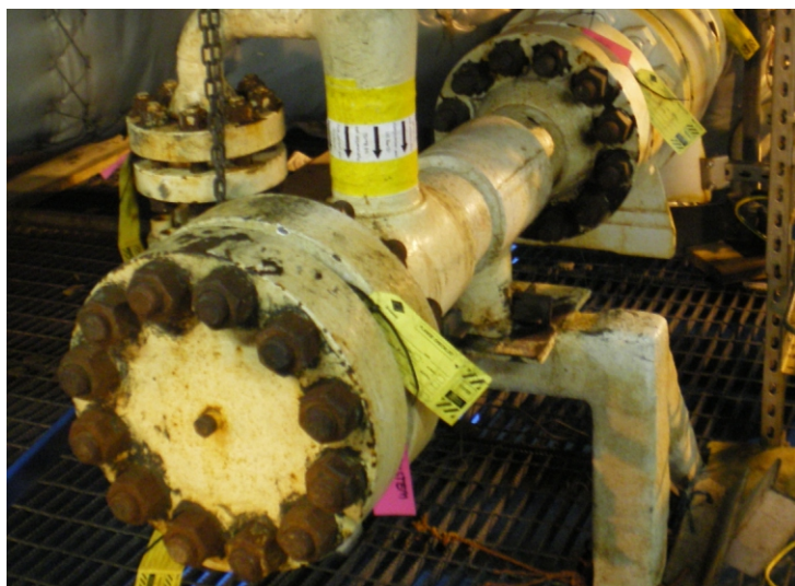
Left: Typical signs of bolt corrosion on the new platform

The reduction in the time available forced a number of operational changes on the project. Manpower was increased from 6 per rotation to 8 per shift, with an extra application unit and full utilization of all machines, rather than having one or two on standby as originally intended. Maximum manning was achieved in August when up to 24 personnel and five application units were on